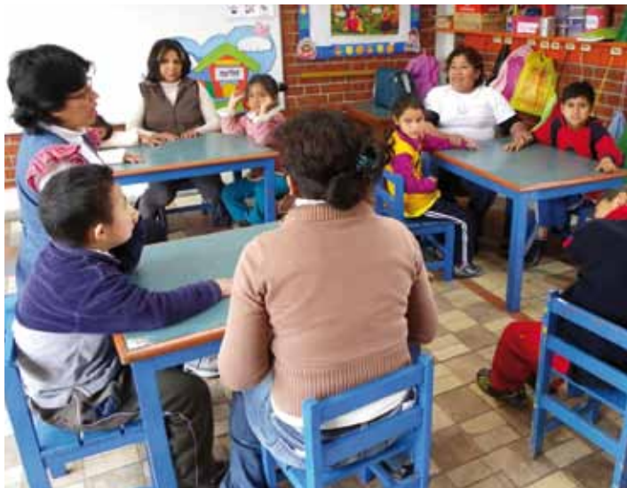
Parents and children at the Manuel Duato school.