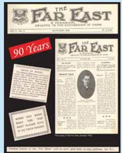
Souvenir insert in The Far East , October 2010.

The Far East magazine turned 90 in October. The first group of Columbans from Ireland went to China in August 1920 and The Far East magazine for Australia and New Zealand began publication two months later.