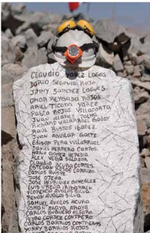
This plaque lists the names of the trapped miners.