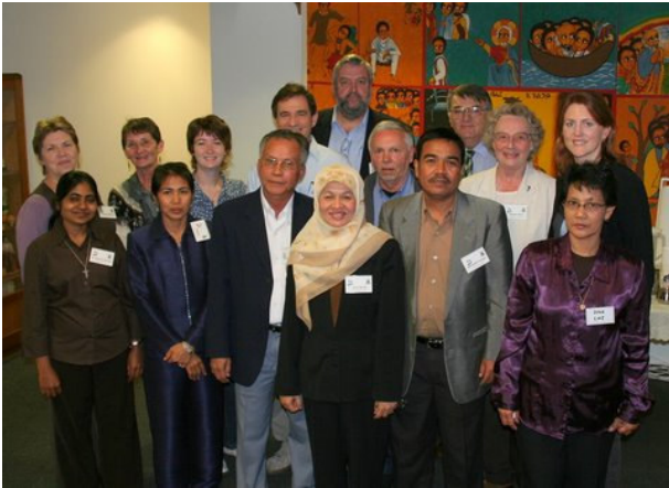
The Thai Delegates with staff of the Columban Mission Institute

A delegation of 5 Thais (4 Muslim & 1 Buddhist) from the Province of Pattani was welcomed by ACU National's Institute for Advancing Community Engagement and Columban Mission Institute on May 14 th . In a country that is predominantly Buddhist, differences in history, culture and religion have all contributed to the recent violence and instability in Pattani, Yala and Narathiwat, the three southern-most provinces of Thailand, where the majority of the population is Muslim.