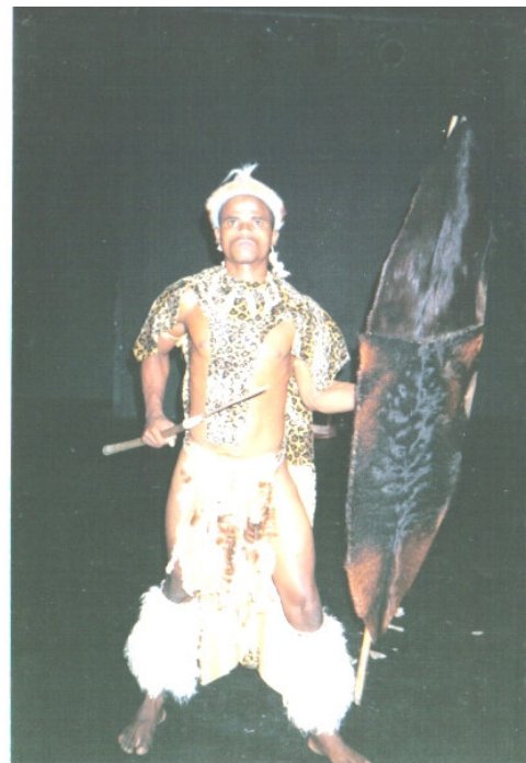
People of Earth, People of Heaven'

People of Earth, People of Heaven at St Peter's College, Tuggerah, and Mt St Mary Campus, Australian Catholic University.