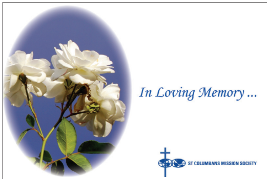
Front of memorial envelope.

In loving memory prayer book $3.30 each Including GST & postage