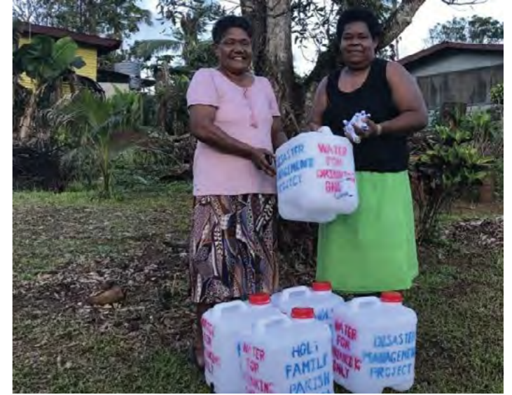
Local Fijian women helping to provide clean water to families.