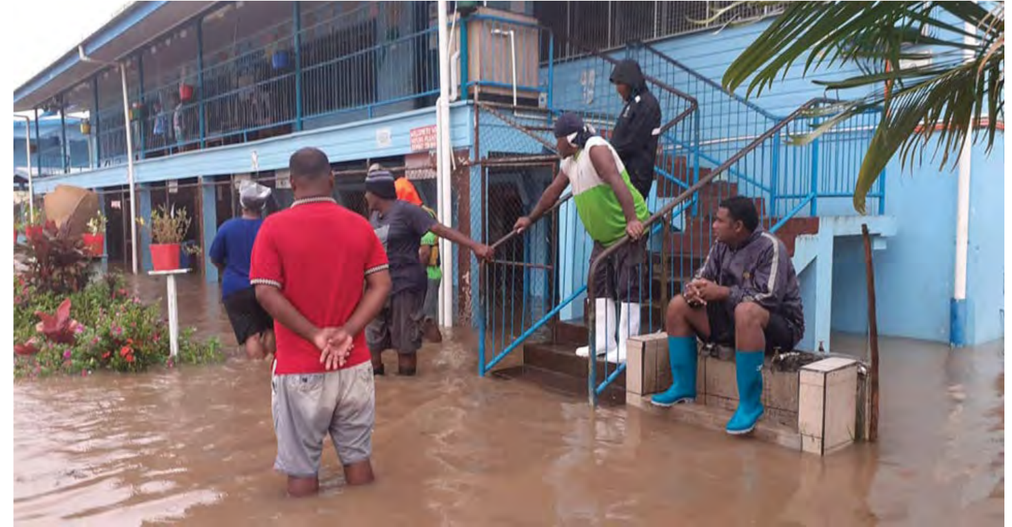
People of Labasa Fiji living amongst the wreckage of cyclone Ana.