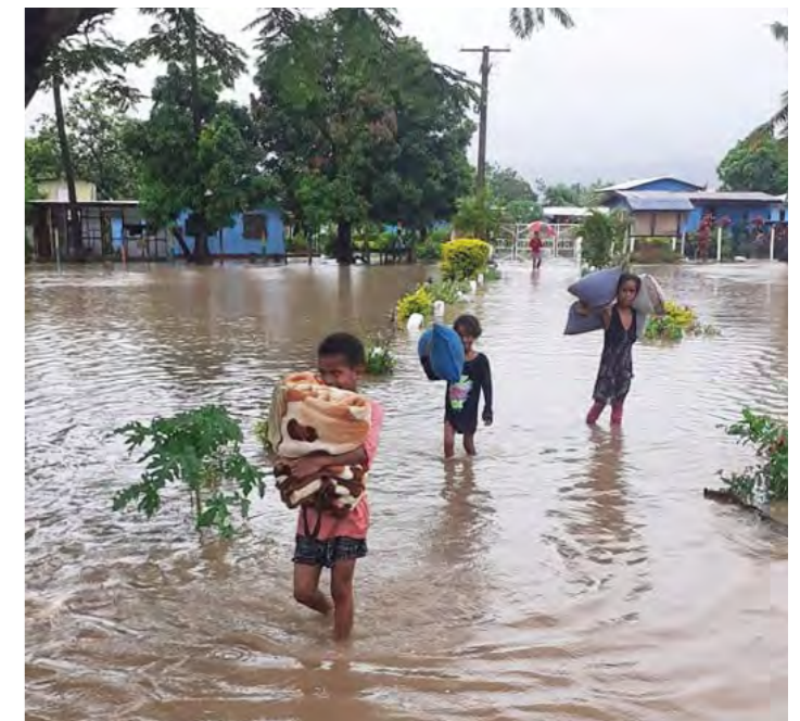
The children carrying their bedding to the school for shelter.