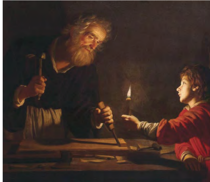
St Joseph the worker.

Pope Francis has named December 8, 2020 – December 8, 2021 as a year honouring St Joseph as the earthly father of Jesus and husband of Mary. It is a year of petition for St Joseph's fatherly care for all people and earth itself. This Year of St Joseph is in honour of the 150th anniversary of St Joseph being named as patron of the Universal Church. www.vaticannews.va/en/pope/news/2020-12/pope-francis-proclaims-year-of-st-joseph.html