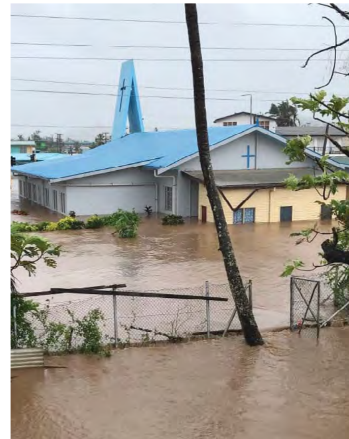
Holy Family Parish Church underwater in Fiji.