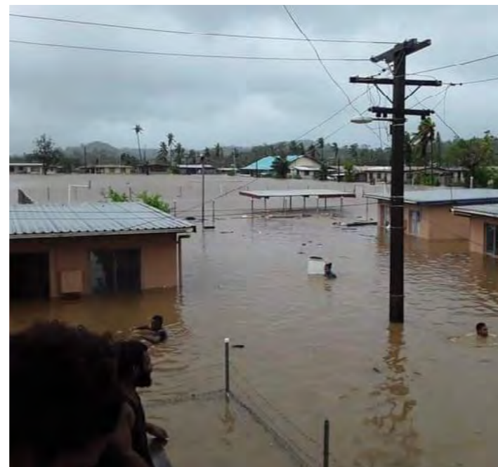
Naodamu, Labasa underwater after cyclone Ana in Fiji February 2021.