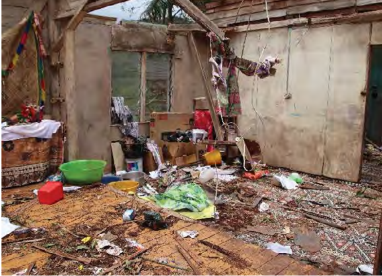
Aftermath of cyclone Ana to homes in Fiji.

ST COLUMBANS MISSION SOCIETY www.columban.org.au f t i c o g + @